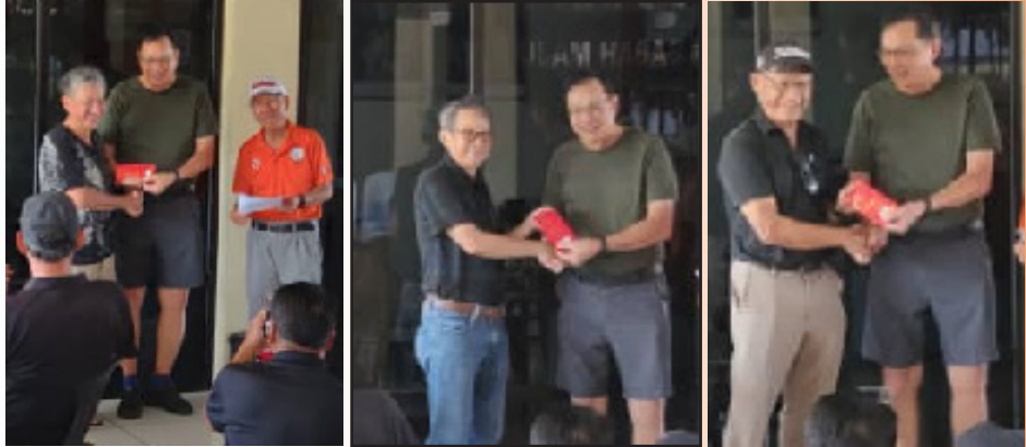
Architect category winners (Image above -From left to right of 1st, 2nd and 3rd prize)